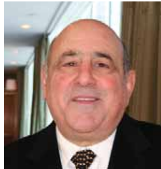
Harvey Brooks Spectrum Signs