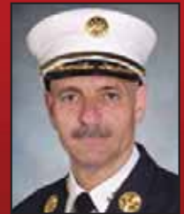
Salvatore Cassano Chief of the New York City Fire Department

Held on Tuesday, November 25, 2008, the BTEA's 2008 Safety Conference and Trade Show focused on the recently enacted city construction safety requirements.